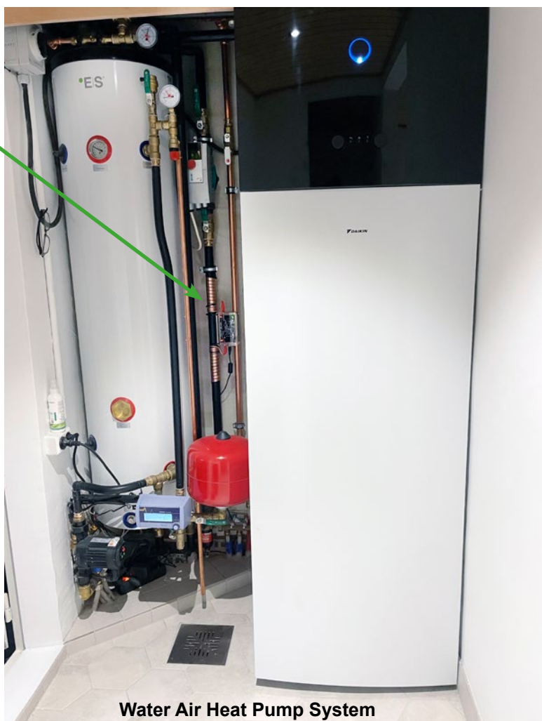
Water Air Heat Pump System