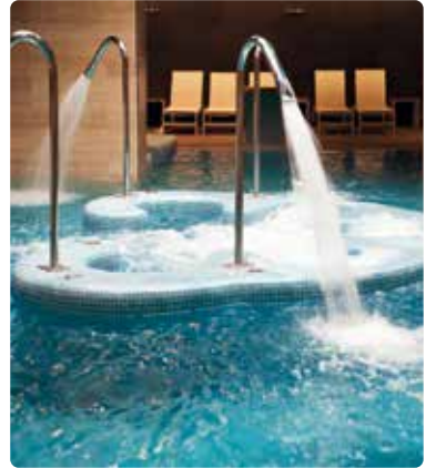
Thermal saltwater pool

Pools are half-open loop systems which suffer constant water loss as the pool water evaporates. The water demands constant maintenance and chemicals need to be added to keep bacteria, algae, and air quality in compliance with standards. Vulcan improves the water quality and with this the effectiveness of certain substances. Vulcan reduces the cleaning effort for the pool itself, the water line, for tiles, grids, floors and walls.