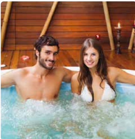
Hotel whirlpool in a wellness area