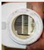
Swimming pool filter