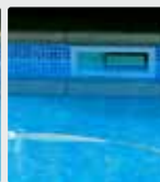
Swimming pool scale line