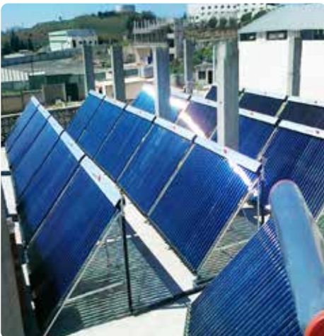
Solar heating panels of an apartment house